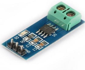
Fig.7. Current sensor

Current sensor is device through which detecting the electric current in a in wire. Whenever the current passing through current sensor the value of current can be measured and can be display in LCD. Basically current sensor is used to measure the current range from Pico amps to 1000 amps. The current sensor is totally depending on the magnitude, accuracy, bandwidth, robustness, cost, etc. shown in figure 7.