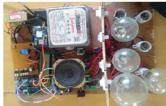
Fig10 . Proposed system

This proposed project voice use as a basis energy meter is develop to alert whenever the utilization be more than the threshold limit. In case of thefting, sensor will observe and through the GSM message will be sent. In present energy meter we r getting monthly billing status, but in our project we will get ensure of our daily consumption levels.