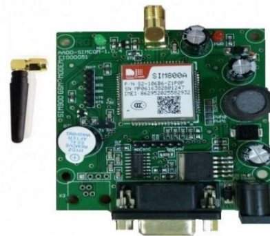
Fig.4. GSM module

GSM is an open and digital cellular technology used for transmitting mobile voice and data services operates at 850 MHz, 900 MHz, 1800 MHz and 1900 MHz frequency band. GSM system was developed as a digital system using time division in multiple access technique for communication purpose shown in figure 4.