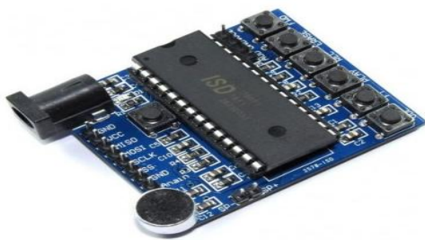
Fig.3. Voice module

This is ISD1760 Voice Recording Playback Module with On-Board Microphone/Voice Recording IC.