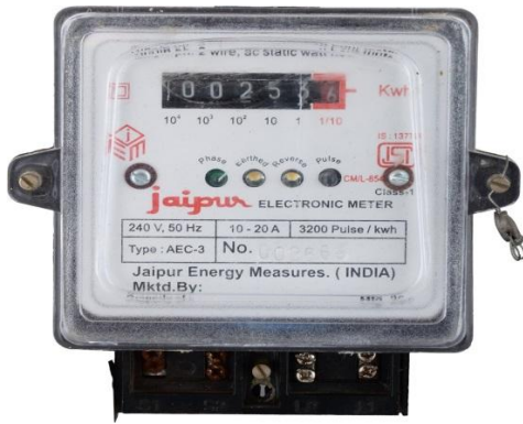
Fig.6. Energy meter

proposed system it will show and speak total power consumption along with Rupees. Shown in figure 6.