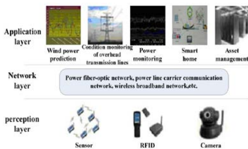
Figure 2. Basic Architecture of IoT in Applications of Smart Grid

According to the current universal approved network architecture of IoT, the Internet of Things for smart grid is broadly divided into three layers: perception (sensing) layer, network layer and application layer, as shown in Figure 2.