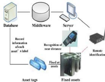
Figure 4. IoT Technology used in Asset Management

China's smart grid, covering all the end-users in China, uses the ultra-high voltage (UHV) as the backbone. The power grid assets are on a large scale, so requires for asset management are getting higher and