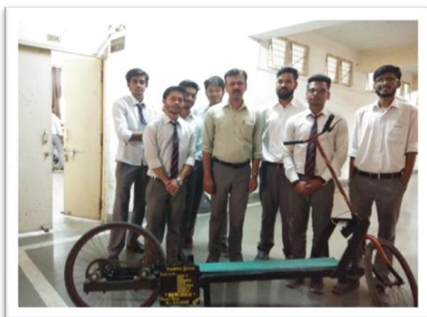
Fig.3. Treadmill Bicycle.

Treadmill is a totally new way of moving. The bicycle when operated we observed that the gear ratio is boosting your walking pace up to the speed of regular bike.