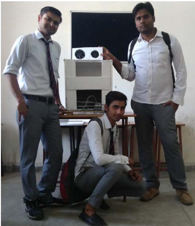
Fig. 1 Photograph with Model

This project is designed on the basis of refrigeration principle, which states that is a process in which work is done to move heat from one location to another. The work of heat transport is traditionally driven by mechanical work, but can also be driven by heat, magnetism, electricity, laser, or other means.