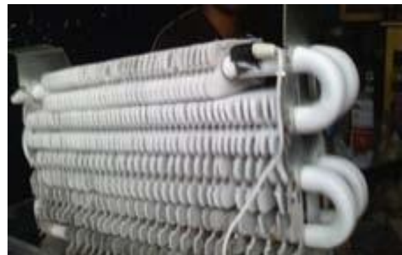
Fig. 3 Actual Picture