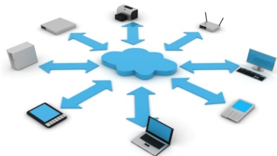
Fig.1: Cloud Computing

The architecture of cloud computing is categorized into Front End and Back End. Front End is User or any application i.e. Web browser etc. whereas back end is network of servers with any computer program and data storage system [13]. Fig. 1 shows the structure of cloud computing [7].