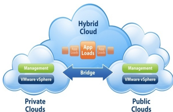
Fig. 2: Cloud Computing Types

Private clouds are normally data enters that are used in a private network and can therefore restrict the unwanted public to access the data that is used by the company. It is obvious that this way has a more secure background than the traditional public clouds. However, managers still have to worry about the purchase, building and maintenance of the system.