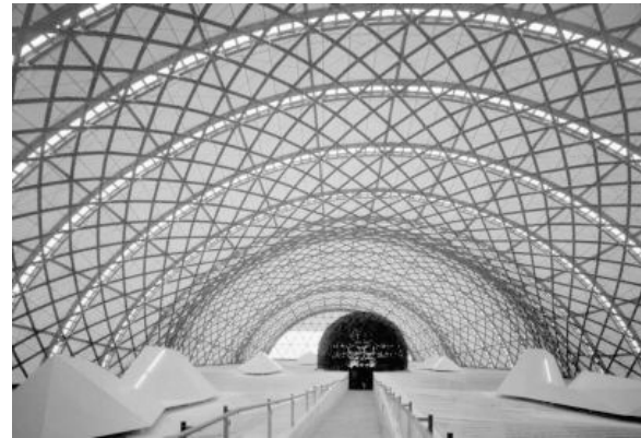
Figure 4: Japanese pavilion at the Hannover Expo by Shigeru Ban and Buro Happold

effortlessly uprooted toward the end of the display. Especially for structures with a short life compass, architects ought to investigate elective materials which accomplish the designing targets of productivity and financial aspects, while decreasing the natural effect of development.