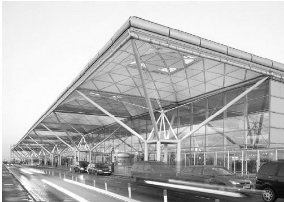
Figure 3. Stansted Airport, England, by Foster and Partners and Ove Arup (1991)

(Meyer 2004). Furthermore, creators ought to look to augment the adaptability of any auxiliary outline, to take into account future changes in the utilization of the building. As a case of a building developed with reused materials and greatest adaptability, the Stansted Airport Terminal in England serves as a helpful contextual investigation. The long compasses gave by the steel modules take into account extraordinary inside adaptability furthermore permit the building to extend and contract as required later on. As building use changes after some time, the perfect structure would permit the change to happen. Something else, an out of date structure will be disassembled and more prominent material utilization will be required for extra new development. At long last, if the Stansted terminal is no more required, the modules could be dismantled and reused on another building site. Rescuing existing steelwork is far desirable over reusing because of the high vitality prerequisites for reusing steel. Auxiliary architects ought to look for chances to rescue and reuse existing structures wherever conceivable.