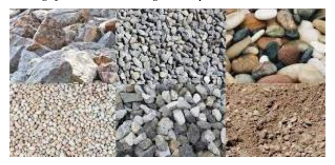
Fig. 3 Coarse Aggregate

Coarse is naturally occurring and can be obtained by blasting quarries or crushing them by hand or crushers.