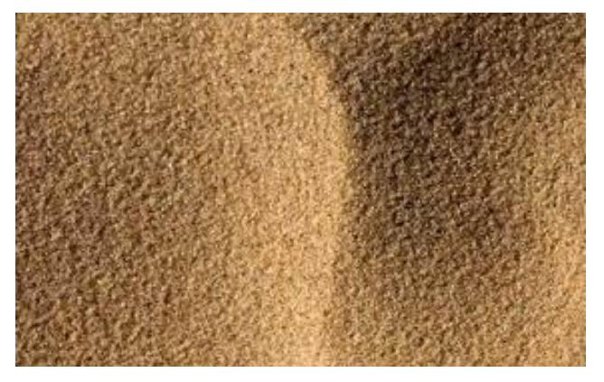
Fig. 2 fine aggregate (sand)

less than 9.55mm in diameter. Sand, crushed stones, ashes, cinder, etc. are the examples of the fine aggregate.