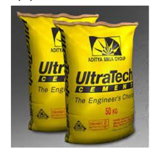
Fig 1 OPC ultra tech cement

Cement is a popular binding material, is a very important civil engineering material. This article concerns the physical and chemical properties of cement, as well as the methods to test cement properties.