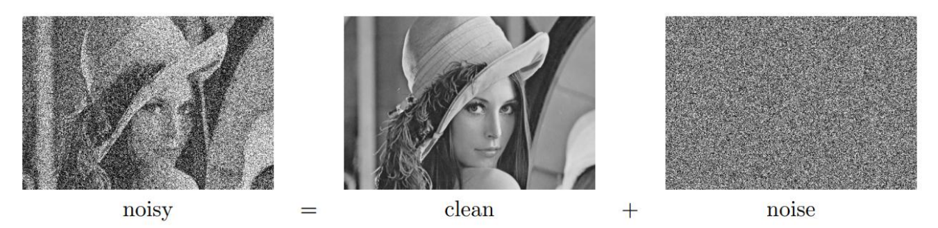
Figure 1.1 A noisy image is assumed to be the sum of an underlying clean image and noise.

Image denoising is the problem of finding a clean image, given a noisy one. In most cases, it is assumed that the noisy image is the sum of an underlying clean image and a noise component, see Figure 1.1. Hence image denoising is a decomposition problem: The task is to decompose a noisy image into a clean image and a noise component. Since an infinite number of such decompositions exist, one is interested in finding a plausible clean image, given a noisy one. The notion of plausibility is not clearly defined, but the idea is that the denoised image should look like an image, whereas the noise component should look noisy. The notion of plausibility therefore involves prior knowledge: One knows something about images and about the noise. Without prior knowledge, image denoising would be impossible.